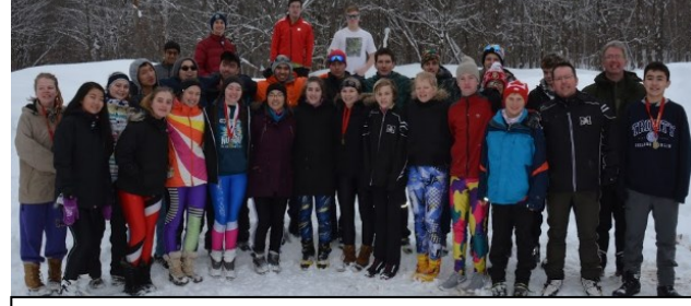
Nordic Ski Team at Eastern Ontario Championships