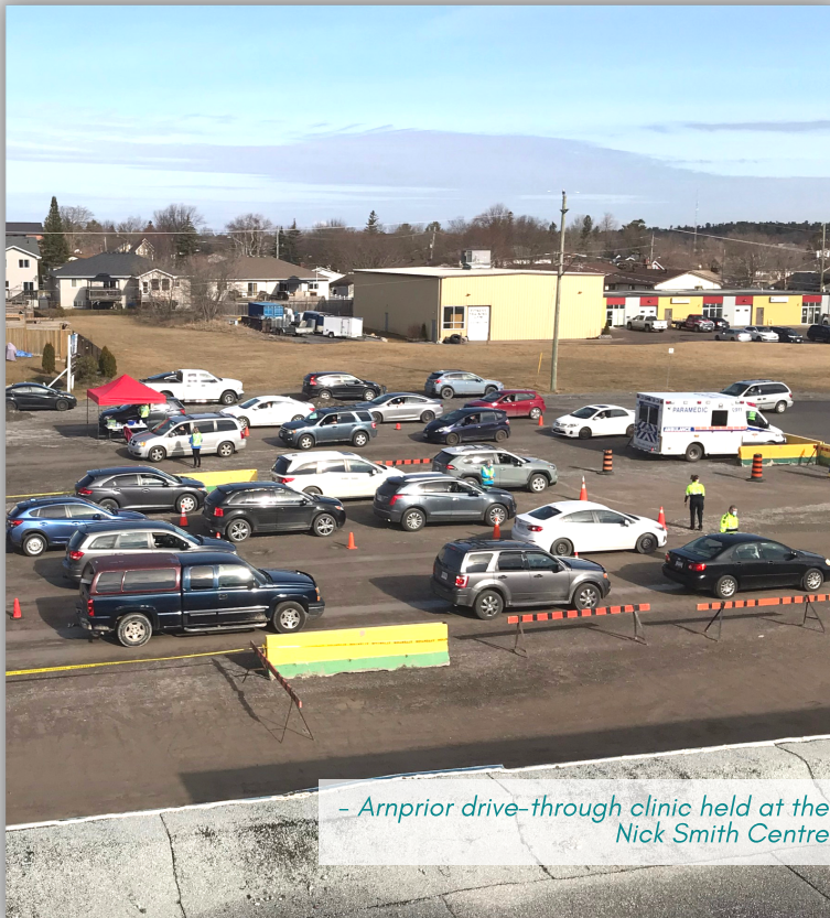
- Annprior drive-through clinic held at the Nick Smith Centre

Note: Eligibility expansion will result in longer wait times for appointments. Please be patient.