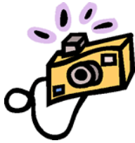
Photo and Media Release

If your child has a serious allergy, please prepare your child for camp by bringing their prescription Epi-Pen. Campers who require Epi-Pens or inhalers in case of an emergency must have their prescription with them in a fanny pack that they can wear at all times. To ensure that everyone has a safe and enjoyable summer, please be respectful of guidelines for communicable diseases. Please do not send a sick child to camp.