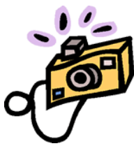
Photo and Media Release

If your child has a serious allergy, please prepare your child for camp by bringing their prescription Epi-Pen. Campers who require Epi-Pens or inhalers in case of an emergency must have their prescription with them in a fanny pack that they can wear at all times. To ensure that everyone has a safe and enjoyable summer, please be respectful of guidelines for communicable diseases. Please do not send a sick child to camp.